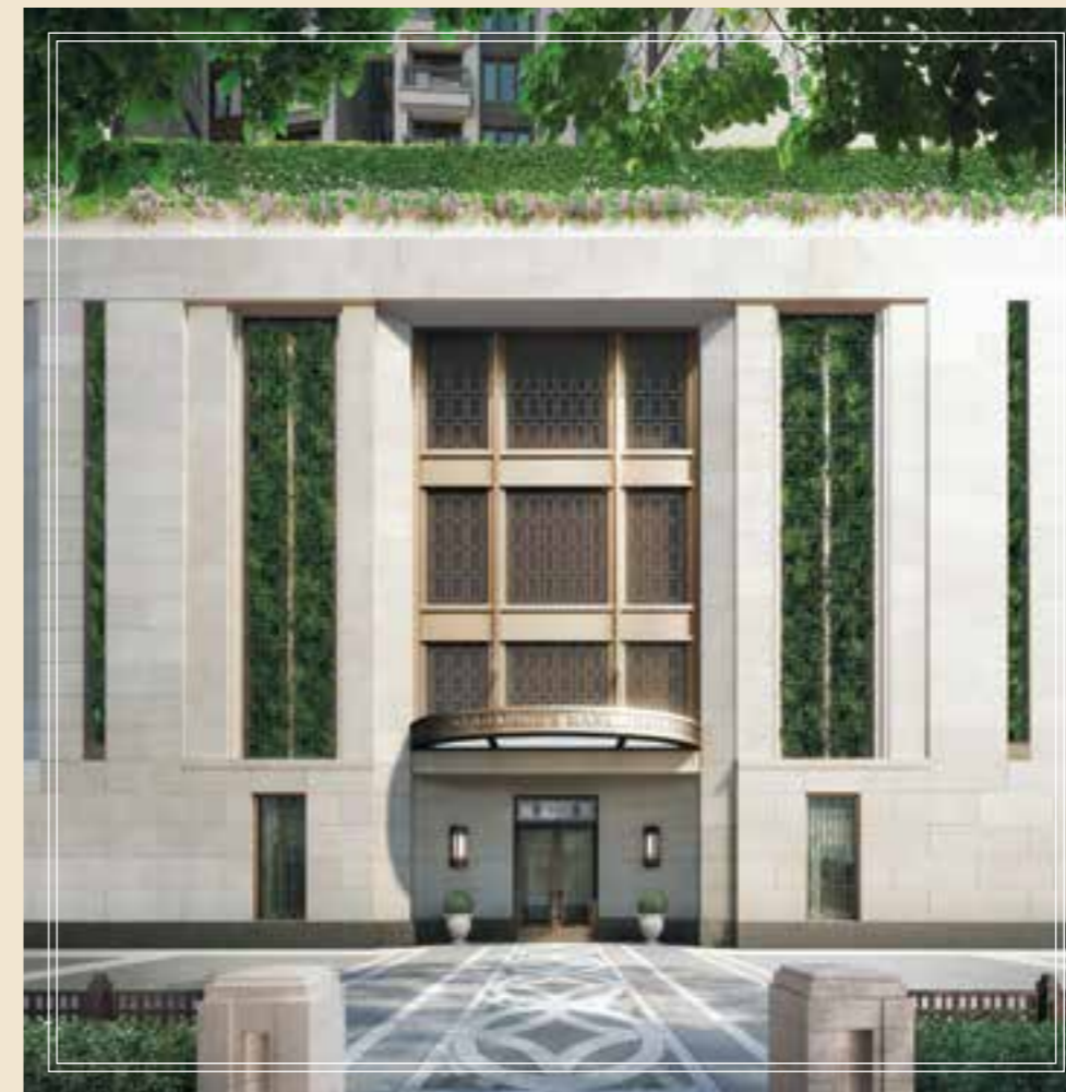
ARGYLE STREET ENTRANCE OF ST. GEORGE'S MANSIONS 1,2,3