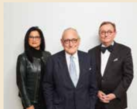
INTERNATIONALLY RENOWNED ROBERT A.M. STERN ARCHITECTS

MASTERFULLY designed by RAMSA, St. George's Mansions embodies the best of modern classical architecture, while remaining rooted in the historical context