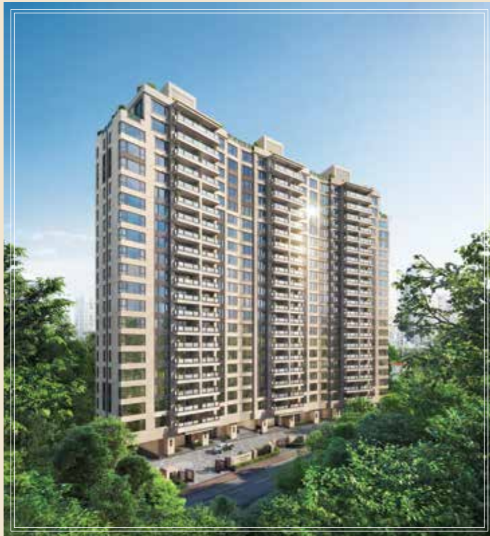
ST. GEORGE'S MANSIONS FAÇADE FACING KADOORIE AVENUE 1,2,3,5

FOR almost 90 years, living on Kadoorie Avenue has been a privilege exclusive to the affluent, the professionals and aristocrats. The tree-lined boulevard sits undisturbed in the middle of the city, a tranquil and idyllic enclave in Hong Kong. The vast majority of properties on Kadoorie Hill are widely known for their not-for-sale policy, and as such, only a select few have had the opportunity to own and pass on the legacy to their future generations. Until now.