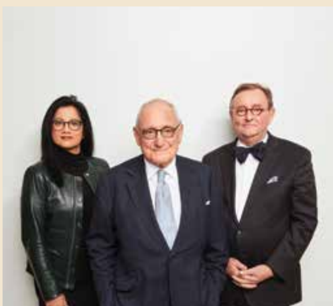
INTERNATIONALLY RENOWNED ROBERT A.M. STERN ARCHITECTS

MASTERFULLY designed by RAMSA, St. George's Mansions embodies the best of modern classical architecture, while remaining rooted in the historical context of Kadoorie Hill. Gascogne Beige Limestone, meticulously curated from Portugal for the exterior of the project, blends with the coloration of most of the villas and garden walls on Kadoorie Hill, tough enough to withstand the local climate and the test of time. St. George's Mansions sketches a stately façade with a commanding presence, creating a delightful rhythm that reflects the heritage of the area.