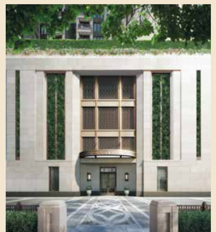
ARGYLE STREET ENTRANCE OF ST. GEORGE'S MANSIONS 1,2,5

"THE GARDEN", an elegant event space designed by PLPL, embraced the concept of "inside-outside living". The view on the beautifully landscaped courtyard provides residents with the quintessential garden house experience.